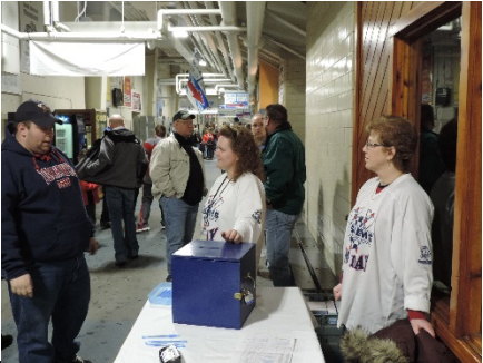
EMS Night at the Johnstown Tomahawks