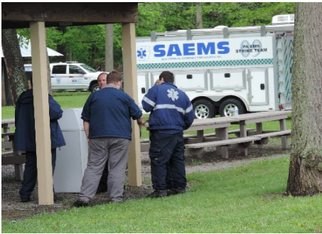
EMS Appreciation Day